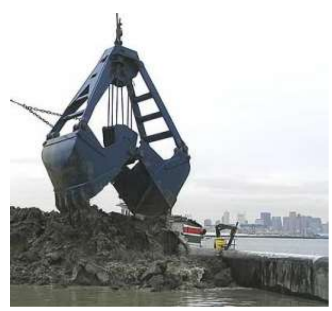
Figure 5 – On the left, a mechanical bucket dredging showing consolidated material, and on the right, the hopper of a dredge showing a slurry of dredged material