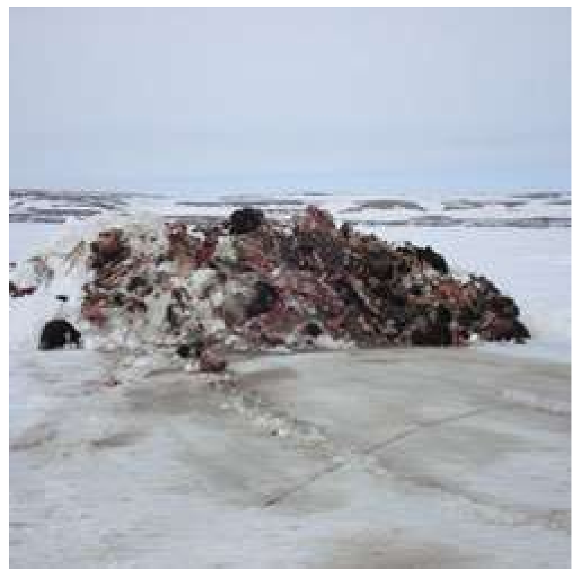
Figure 4 – Organic waste (musk ox offal)