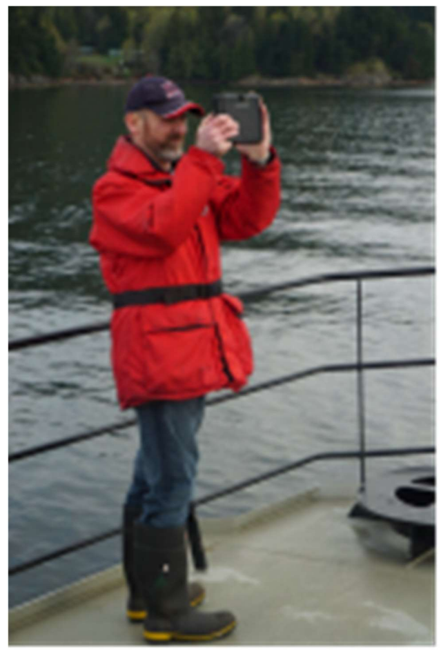
from the shoreline or from other vessels.

From the shoreline, observers can note the loading and disposal actions including start and finish times and locations, the direction of travel of the disposal vessel, and the disposal location if relatively close to shore when the material is deposited. In addition, observations from other vessels can provide this information and can be used if the dump-site is farther off shore.