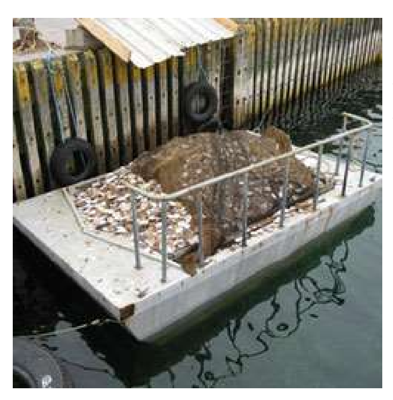
Figure 2 – Fish wastes on a barge. Note that spillage is possible so weather and wave conditions should be acceptable on the way to the dump-site to prevent loss of materials